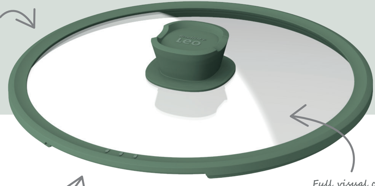
Full visual control during cooking process