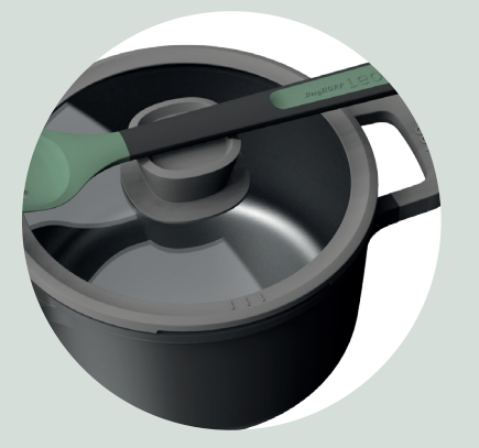
Special knob with spoonrest

No noisy rattling during cooking/boiling process