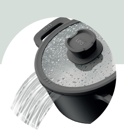
Pouring made easy thanks to the special design of the rim

Silicone rim for tight closure to the body